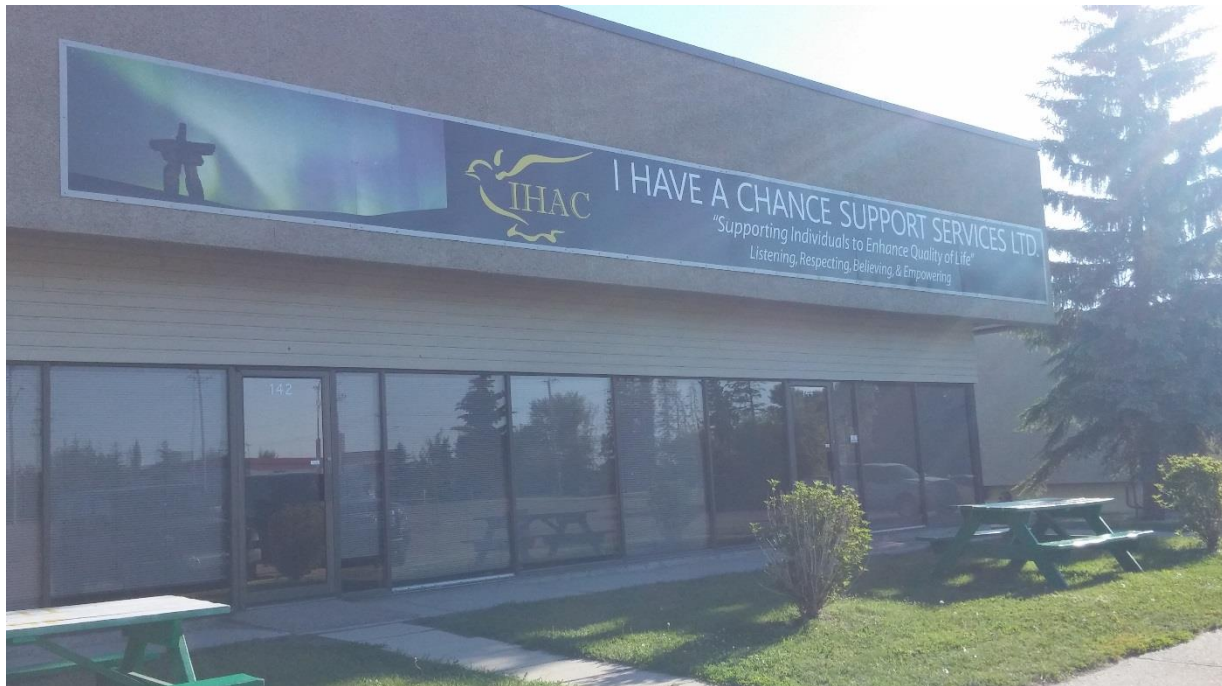
(IHAC Administration Office)

I Have A Chance Support Services Ltd. also known as IHAC, first opened its doors in 1987. We began as an early intervention program offering in-home respite to families in need.